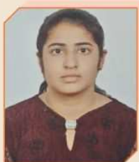
Srishti 8.13 SGPA 3rd in College 3rd Semester