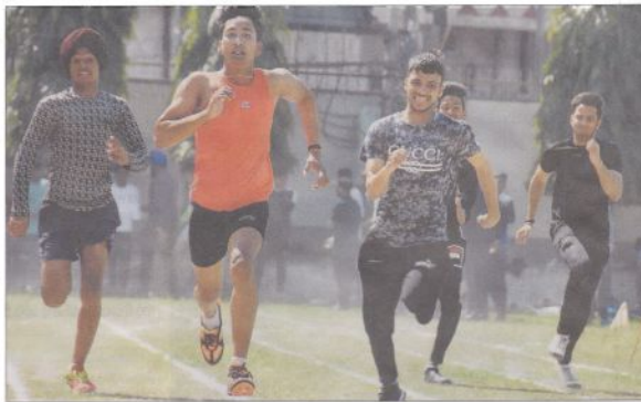
Students participate in races during the annual athletics meet at Arya College in Ludhiana.